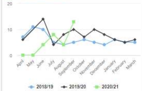
WD-P12 Pre-Apps Received