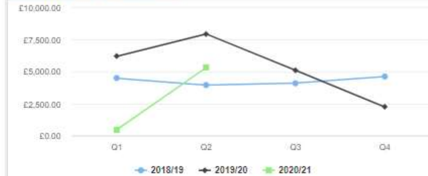
WD-P11 Fee Income from Pre-Apps