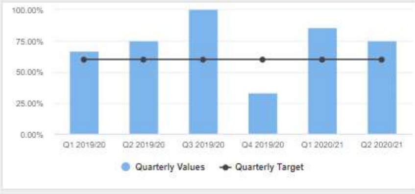
WD-P1 Major Apps on target