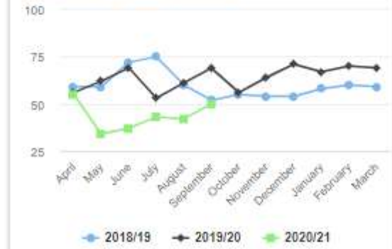
WD-P13 Pre-Application workload