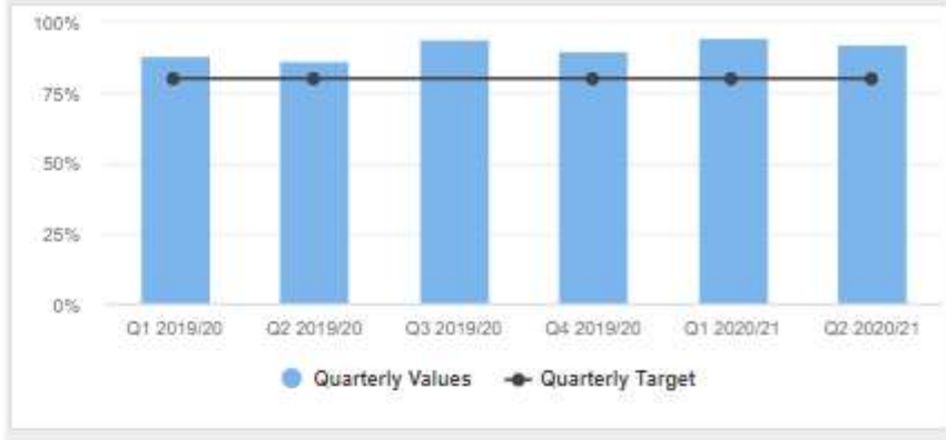
WD-P2 Non-Major apps on target