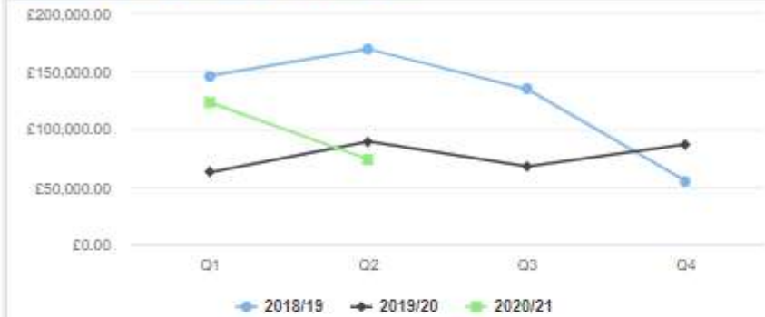
WD-P10 Fee Income from Planning Applications