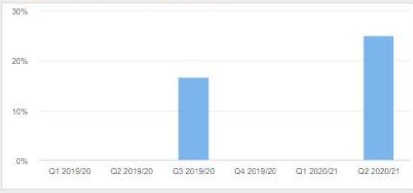
WD-P4 Major applications on target without eot