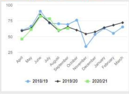
WD-P7 No of planning applications registered