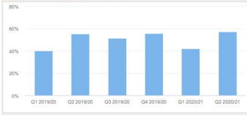
WD-P5 Non-Major apps on target without eot